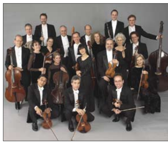
Orpheus Chamber Orchestra