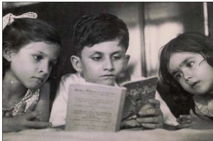
A multimedia exhibition of Salman Rushdie's manuscripts, drawings, journals, photos and digital materials opens Feb. 26. SPECIAL