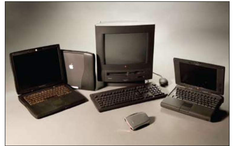
Rushdie's computers are a case study in the nascent field of archiving "born-digital" materials.