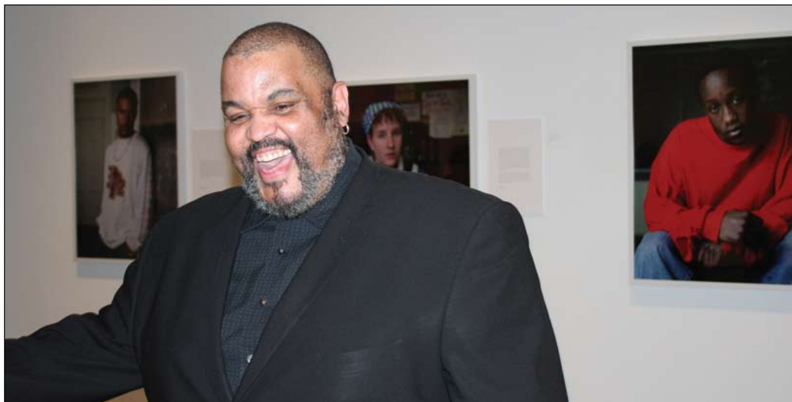
Dawoud Bey at the opening of his "Class Pictures" exhibit at the Visual Arts Gallery