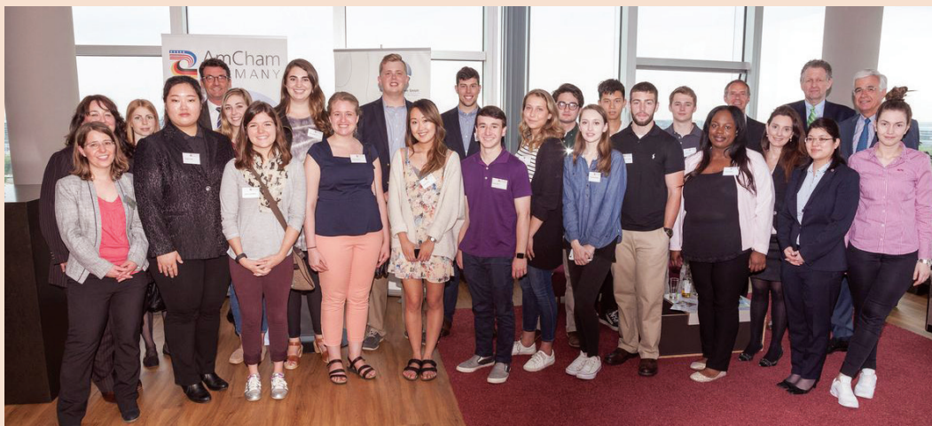
US-Germany interns at the welcoming ceremony in Frankfurt in May