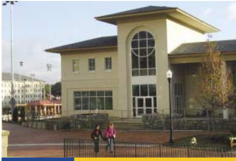
The plaza at Clairmont Campus where the bricks will be installed.

IN FALL 2002, EMORY CELEBRATED THE OPENING OF the new Clairmont Campus. As an individual who has spent time at the University, you have helped make Emory the great institution it has become. Now, you can become a permanent part of Emory by purchasing a brick engraved with your name in the plaza of Emory's Clairmont Campus.