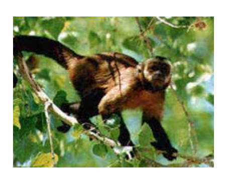
<u>II.1 - MONKEYS</u> <u>Family 1 - CEBIDAE</u> (CAPUCHIN-LIKE MONKEYS)

Distribution: Neo-tropics and -subtropics. Mostly arboreal, many species with prehensile tails. Genera include: Cebus (capuchins), Saimiri (squirrel monkeys), Callicebus (titi monkeys), Ateles (spider monkeys), Alouatta (howlers), and Brachyteles (muriquis; with over 12 kg, the largest Neotropical primate).