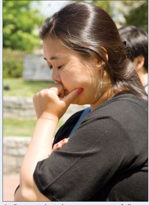
An Emory student observes a moment of silence for the victims of the Virginia Tech shootings.