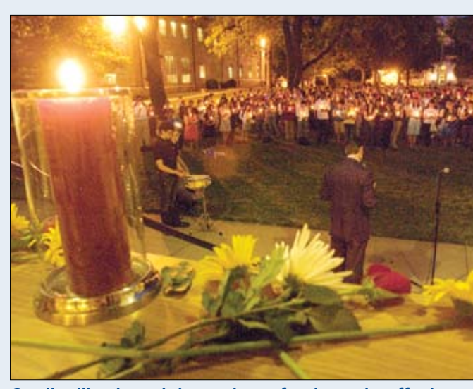
Candles illuminated the students, faculty and staff who came together in support and solidarity for the Virginia Tech community.