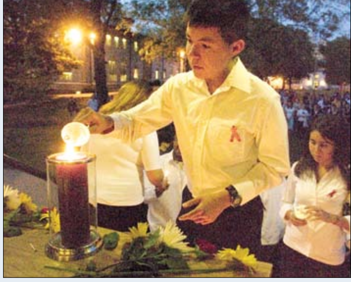
A mourner lights a candle to remember the 32 people killed by the gunman.