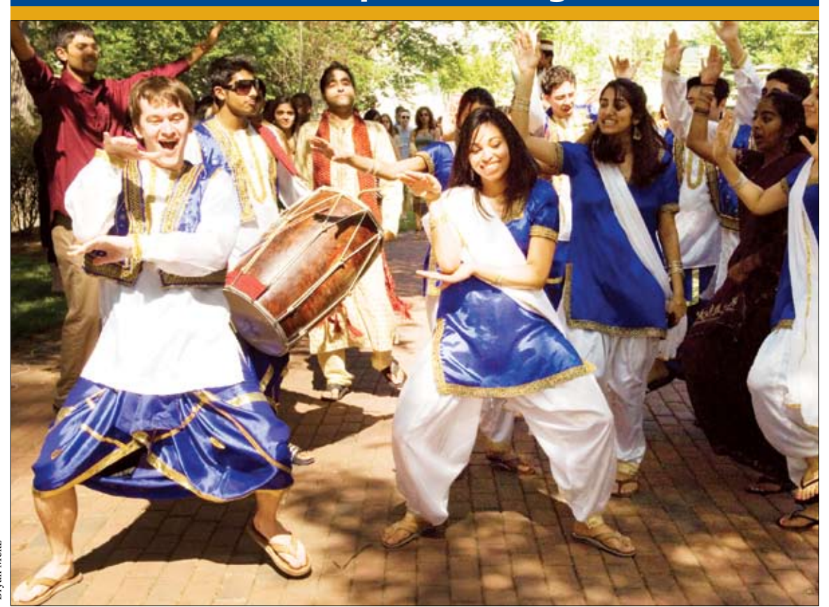
Emory's resident bhangra team, Karma, performed at a mock Hindu wedding ceremony held April 21 in Cannon Chapel. Their performance followed the baraat, or processional, in which the groom is led to the bride astride a horse with musicians and dancers following him. The ceremony was sponsored by the Hindu Students Council, the Inter-Religious Council and the Office of Multicultural Services in an effort to educate the Emory community about Hindu religious traditions and ceremonies.