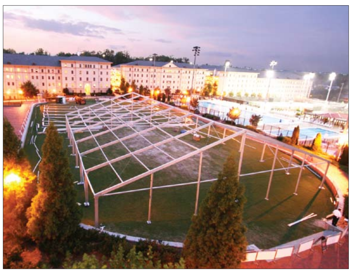
The Campaign Emory tent takes shape on the Clairmont Campus.