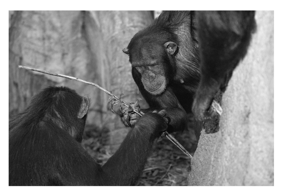
Figure 1. Two chimpanzees sharing a hole while fishing at an artificial termite mound.

where the artificial termite mound was located, contained climbing structures of varying heights, deep-mulch bedding and was visible to the general public during daytime hours. Daily meals of fresh produce and biscuits were scattered through the exhibit twice daily, but never within 1 h of testing.