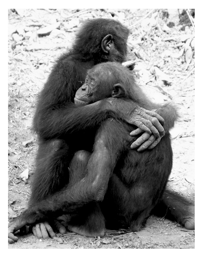
Fig. 1. One juvenile bonobo embraces a distressed companion during postconflict consolation. Photograph by Zanna Clay at the Lola ya Bonobo Sanctuary in the Democratic Republic of the Congo.

Juvenile bonobos with signs of better social and emotional competence were more likely to respond to the distress of others by offering consolation. There was a direct positive correlation between how juveniles handled their own distress events as victims and how they responded to distress witnessed in others: individuals quicker to recover from their own distress as victims were more likely to provide bodily comfort to others. Individuals with higher sociality (expressed in the CSI, a marker of overall social competence) were most likely to offer consolation and approach victims rather than fleeing (expressed in the PRI). In agreement with human infant studies (45, 47), sociality was the best predictor of consolation behavior. Consistent with empathy-