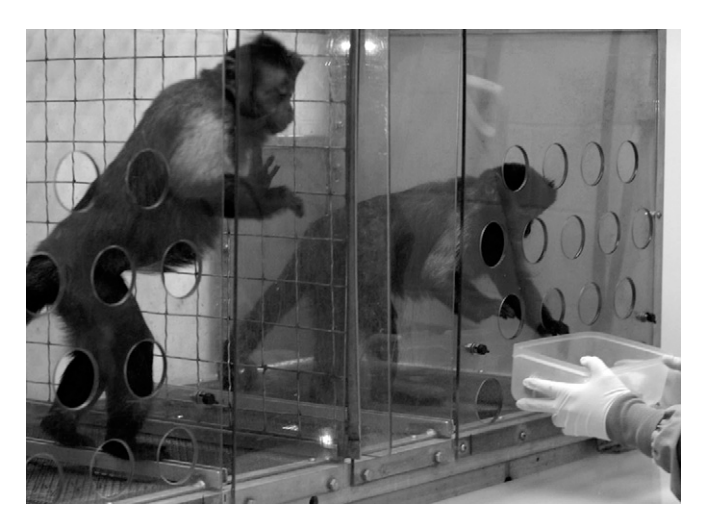
Fig. 1. Experimental setup. A capuchin actor selects a token from the jumble of six tokens (n = 3 of each type). Her partner watches through the clear Lexan panel separating the two individuals. Following a token choice, the experimenter holds her hand up in a begging gesture, and the capuchin returns the token to her hand.