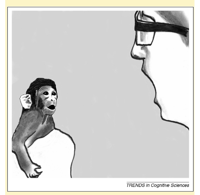
Figure I. Like human neonates, infant rhesus monkeys spontaneously mimic the mouth movements of a human experimenter suggesting the early presence of a neural mirroring system shared across species. Drawing by Frans de Waal from Ref. [57].

The role of mirror neurons in imitation is sometimes questioned because these neurons were discovered in monkeys, which lack imitation [52]. The latter statement is only true, however, if we narrowly define imitation in terms of the understanding of another's intentions or of copying complex novel sequences. By any other standard, monkeys do have imitative skills. In the wild, they show socially learned cultural variation on a par with that of apes [53], and in the laboratory they reliably copy a conspecific's motor actions [54,55]. The tendency to do as others do is spontaneous, because monkeys require no rewards for it [56]. There is also evidence of neonatal imitation in monkeys [57] (Figure I) and an ability to recognize when they are being imitated [58]. In sum, if action coding is the essence of imitation, as argued here, monkeys most certainly qualify as imitators.