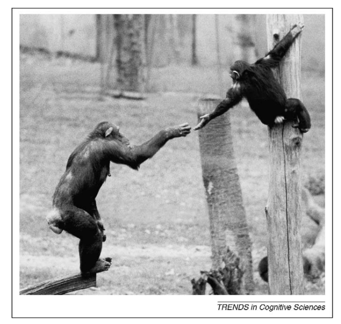
Figure 1. Chimpanzees frequently react to another's need or distress with directed altruism. Here, a mother, having heard her son's screams, stretches out a hand to help him out of a tree. Recent experiments confirm that nonhuman primates care about the welfare of others, both kin and nonkin.

Empathy might be widespread in mammals. It is thought to stem from an evolutionarily ancient perception-action mechanism, the most basic form of which is state matching, also known as emotional contagion [65].